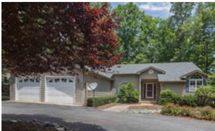
23 Oak Grove, Lake Monticello $275,000