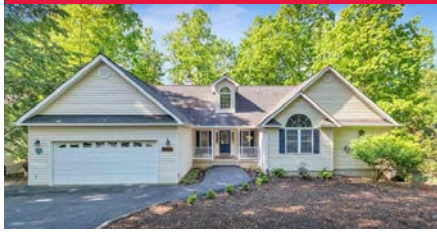
259 Jefferson Dr, Lake Monticello $320,900