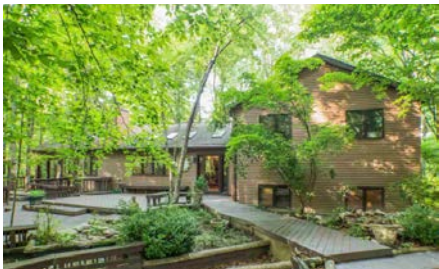
5 White Bluff Ct, Lake Monticello $449,000