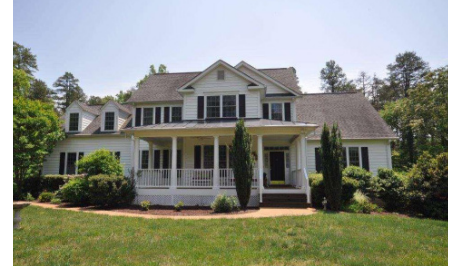
103 Taylor Ridge Way, Palmyra $500,000