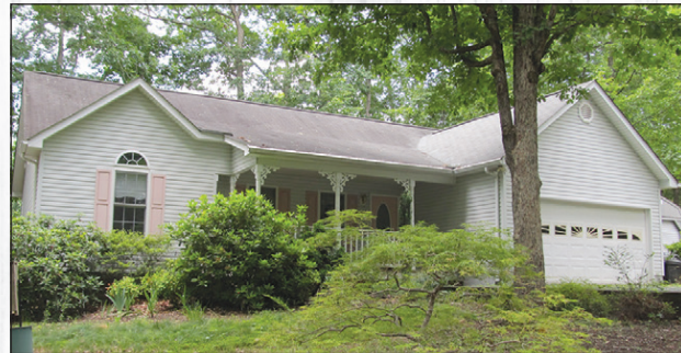
10 Nahor Drive $186,000

Immaculate one level with 3 bedrooms, 2 bath, huge living room, vaulted ceilings. Eat in kitchen with white cabinets, pantry & upgraded appliances. Attached 2 car garage.