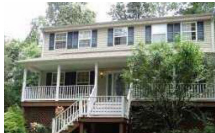
801 Jefferson Drive, Lake Monticello $259,000