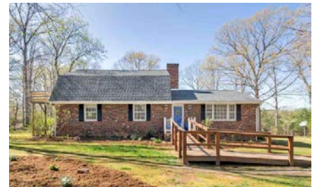
410 Way Station Ln, Kents Store $399,999

For more information, please contact us at (434) 589-1685 or fluvannamealsonwheels@embarqmail.com