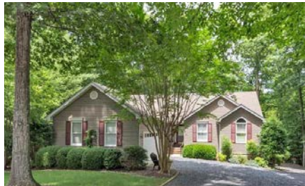
23 Sand Trap, Lake Monticello $355,000