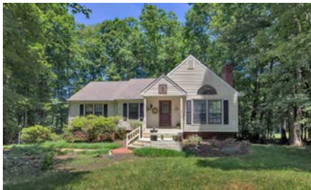
27 Bunker Boulevard, Lake Monticello $269,000