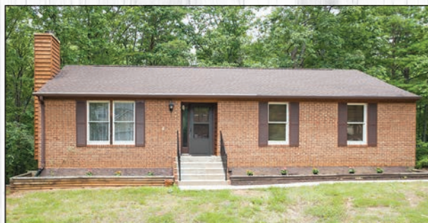
15 Patriot Lane $195,000

Directions: Lake Monticello Riverside Entrance: South Boston Rd. to River Ridge Rd. Right on Riverside and follow to end of cul de sac.