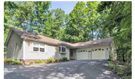
10 Dogleg Dr, Lake Monticello $189,999