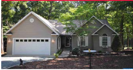
43 Out of Bounds, Lake Monticello $290,000