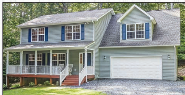
131 Riverside Drive $265,000

Directions: Lake Monticello Main Gate: Left on Jefferson; left on Bunker. Go past new clubhouse to home on the right.