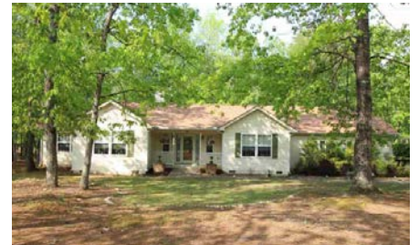
28 Oak Grove Rd, Lake Monticello $315,000