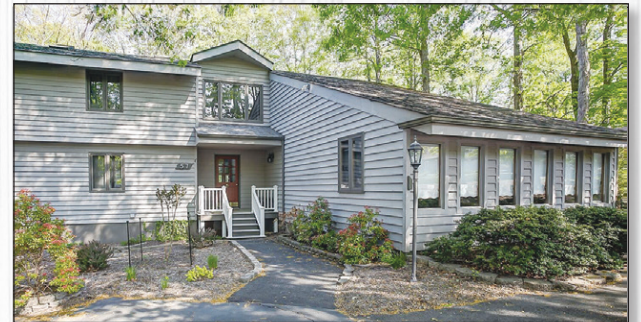
57 Bunker Boulevard $359,900

Golf course contemporary with water & golf views. 4 bedroom, 4.5 bath, first floor master suite & finished terrace level with in law suite. Stone fireplace, sun room & dual HVAC.