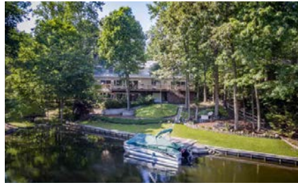
17 Piedmont Ln, Lake Monticello $850,000