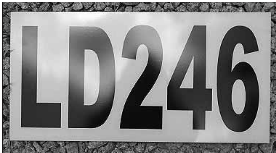
In the past month, Lake Anna dock owners have requested 911-coordinated yellow dock letter/number signs that can be used to assist marine emergency personnel.