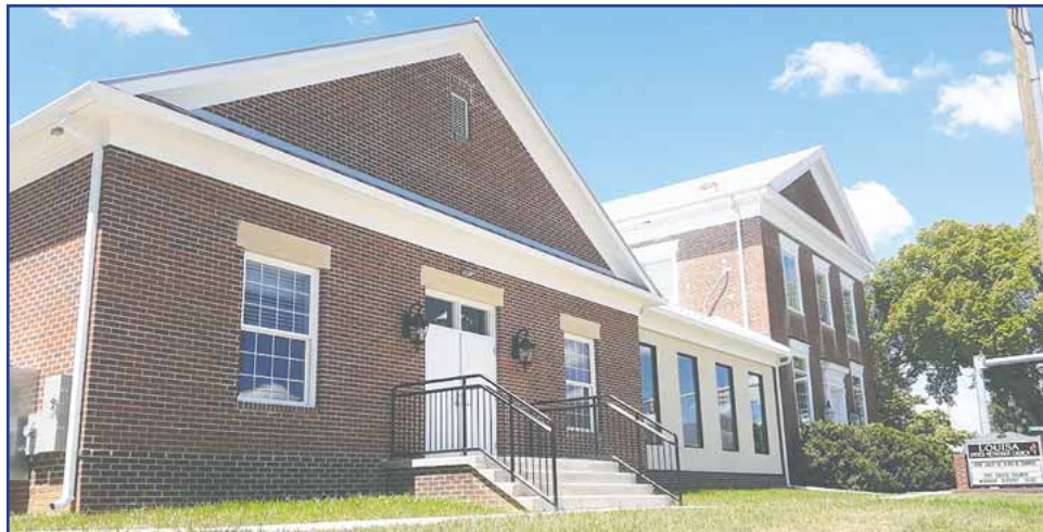
Until the completion of the new parish hall at the Louisa United Methodist Church, the Louisa Community Chorus primarily rehearsed in the sanctuary.

After a major power outage following a snowstorm a few years ago, the church posted big thank you to the Dominion power workers on its sign. They then decided that they would become known as