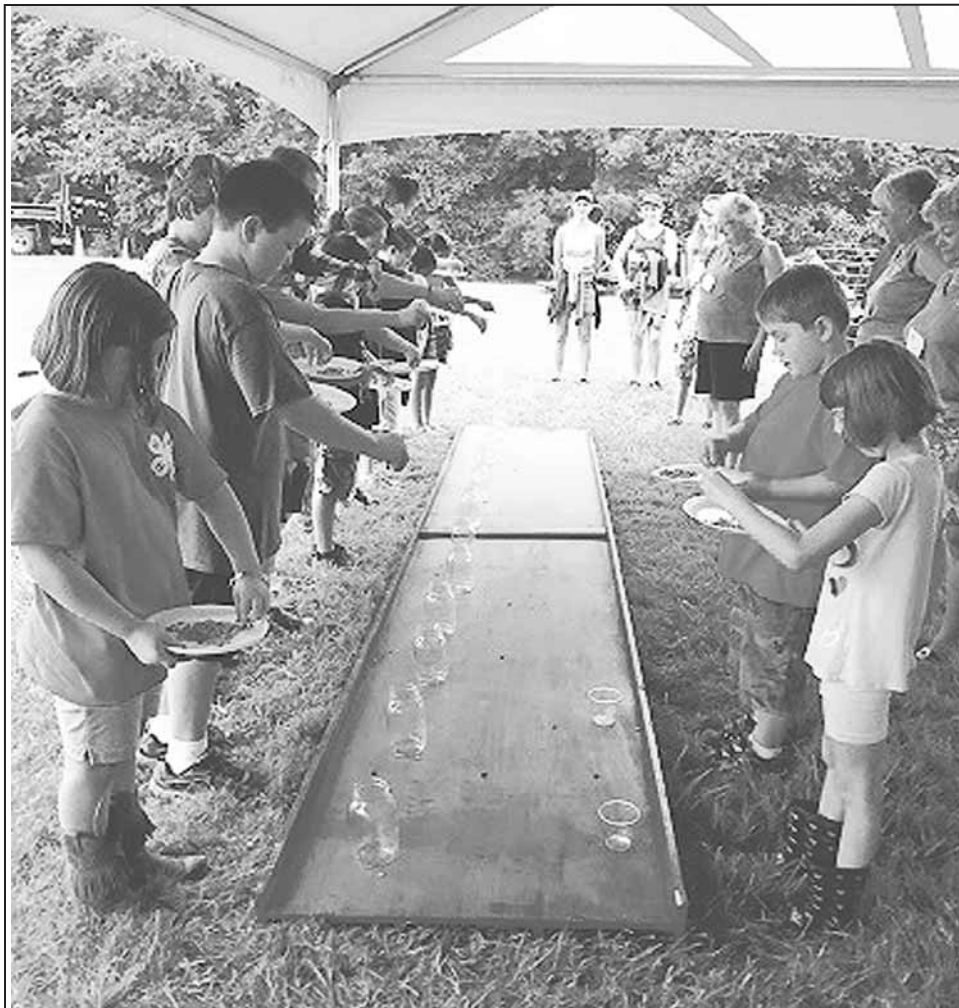
Dropping beans into jars is one of the popular competitions under the games tent at the Louisa Ag Fair.