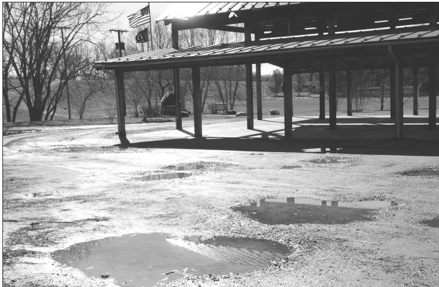
Standing water at the Farmers Market Pavilion.