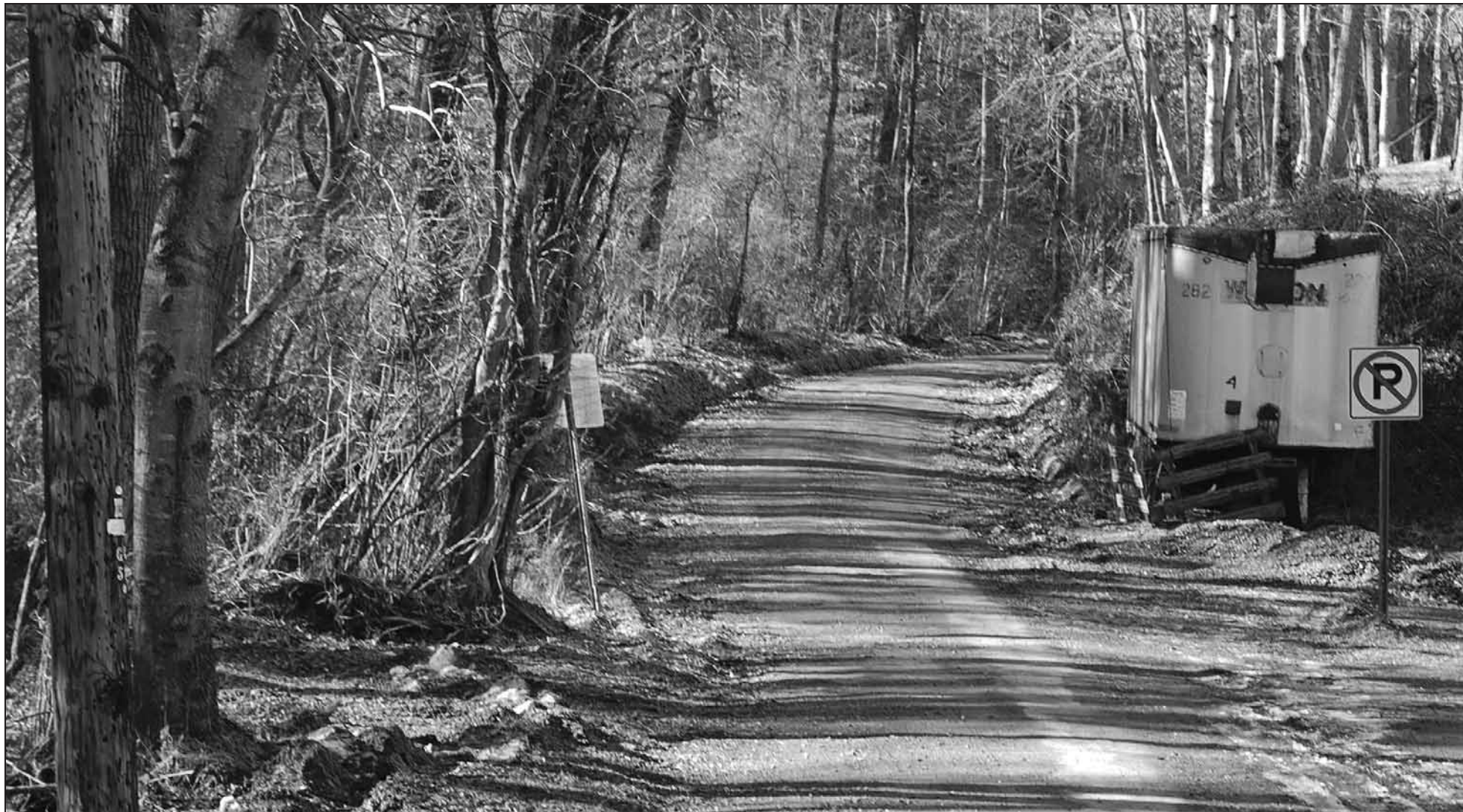
Mt. Vista Road is a narrow, steep and sometimes dangerous road to travel.