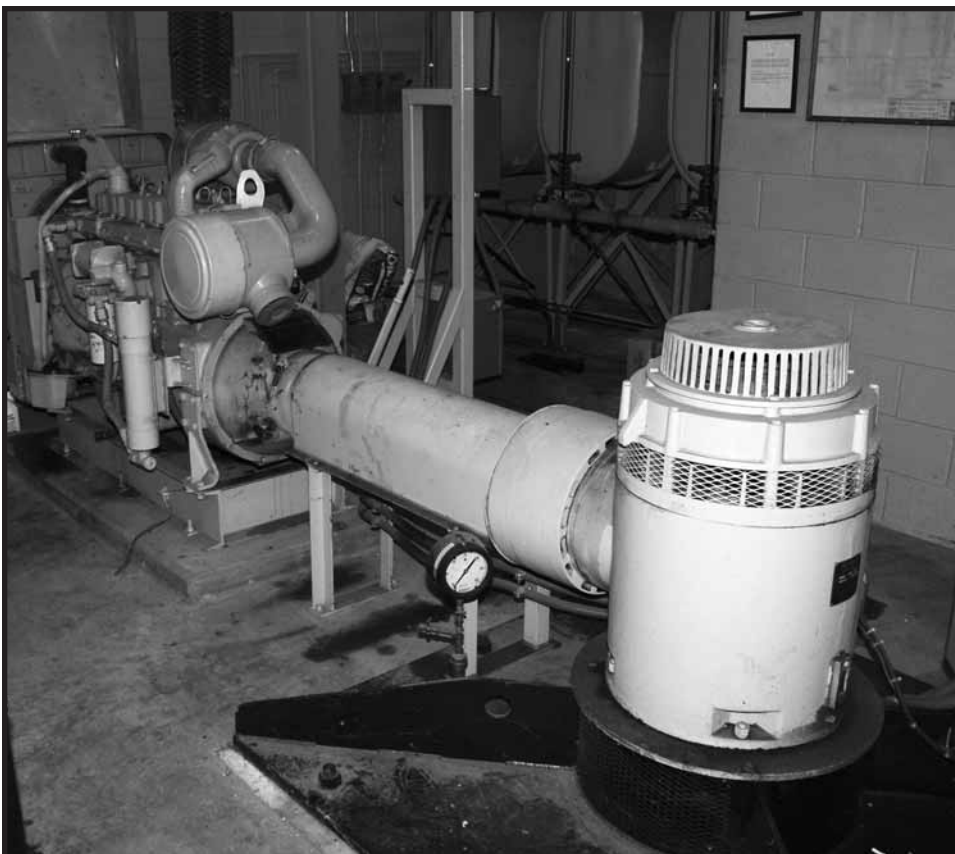
Pumps that need maintenance work performed.