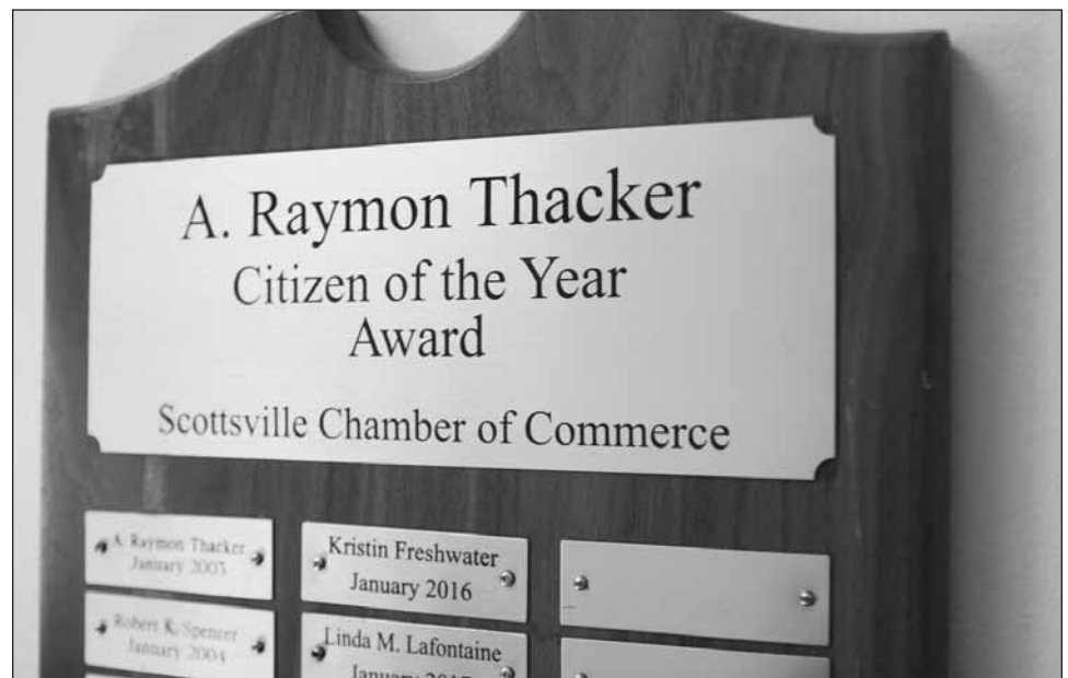
Citizen of the Year plaque.