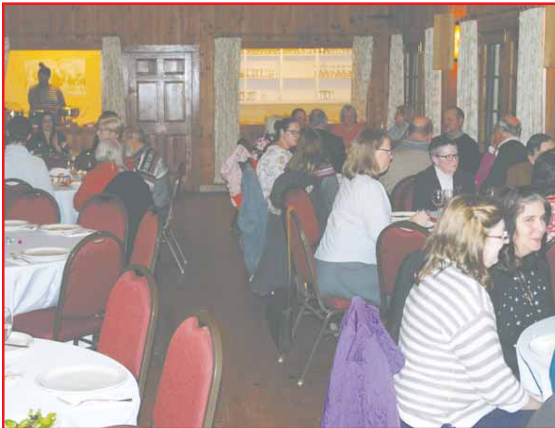
Annual Chamber members enjoy a great meal at the annual dinner.