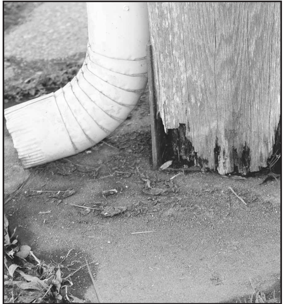
Water is damaging the support columns at the Farmers Market Pavilion.