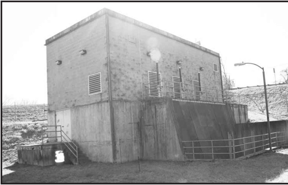
The pumping station.