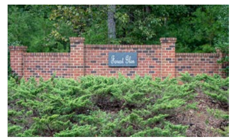
Forest Glen, Palmyra From $50,000