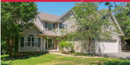
454 Jefferson Dr, Lake Monticello $265,000