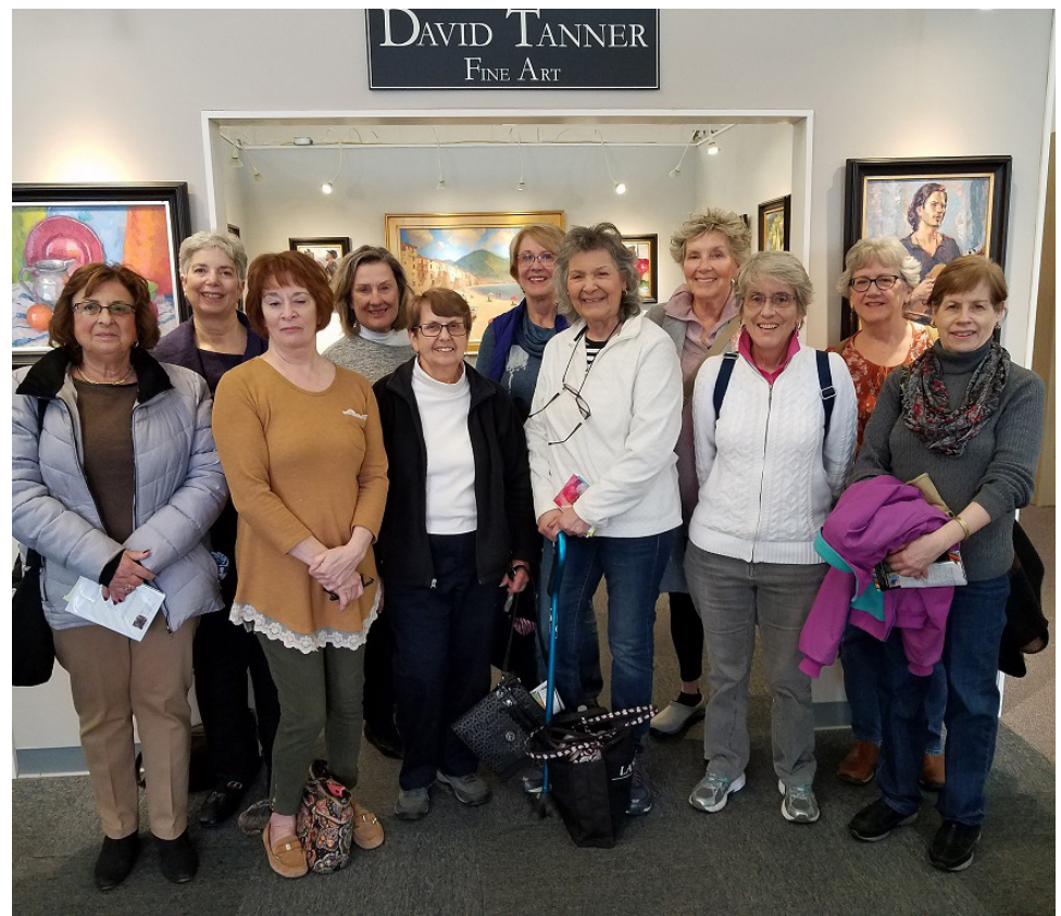
Members of the Fluvanna Art Association.