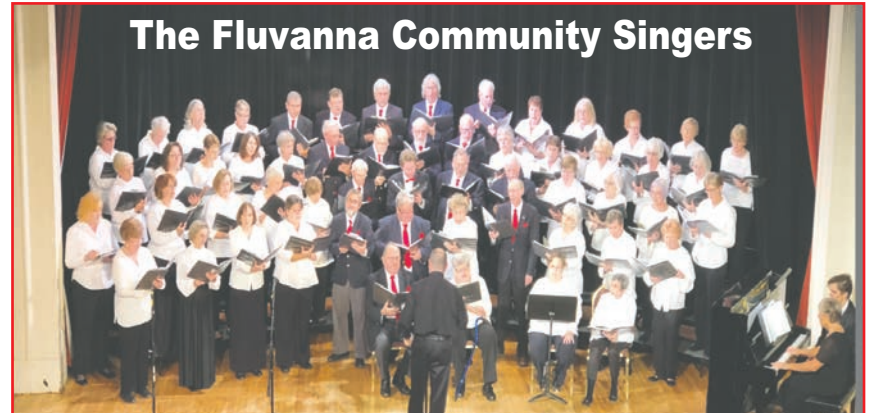
The Fluvanna Community Singers

Presents the 2019-2020 Season at Carysbrook Performing Arts Center