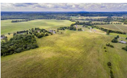
Mountain Vista Road, Scottsville $309,000