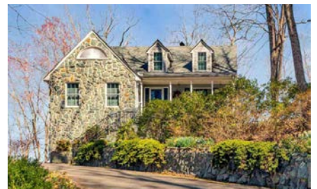
308 Scenic River Dr, Palmyra $350,000