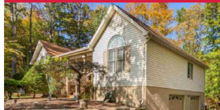
6 Towpath Court, Lake Monticello $399,000