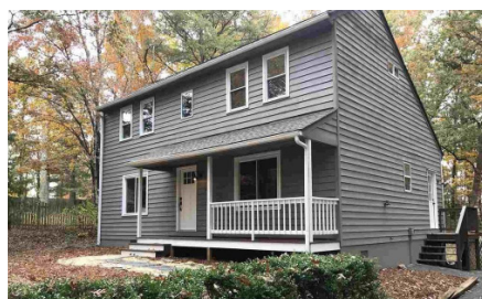
9 Green Court, Lake Monticello $194,900