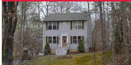
4 Riverside Drive, Lake Monticello $175,000