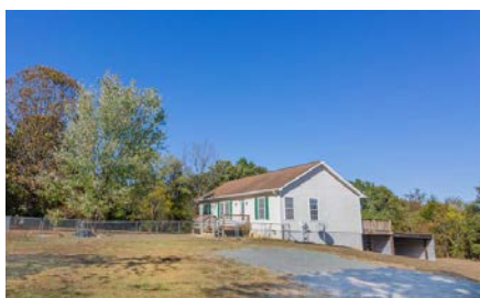
214 Troy Road, Troy $239,000