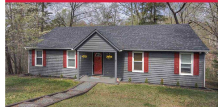
9 Old Homestead Circle, Palmyra $184,900