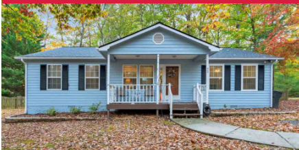
25 Xebec Road, Lake Monticello $199,900