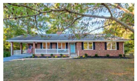
714 Gale Hill Road, Fork Union $249,000