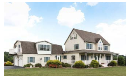
1368 Rivanna Woods Rd, Fork Union $475,000

CALL OR STOP BY TODAY | (434) 589-7653 3661 Lake Monticello Rd Next To Monticello Mulch AGENT ON DUTY MONDAY THROUGH SATURDAY 9am-5pm