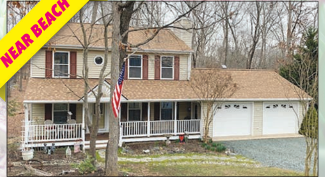
45 Amethyst Road $247,700

Meticulously maintained 4 bedroom, 2.5 bath home. Walk to beach 3. Over 2120+ fin. sq. ft. with formal living & dining rooms, upgraded kitchen with ss appliances, granite counters & island. Huge master suite with attached bath walk in closet, jetted tub & stairs to storage attic.