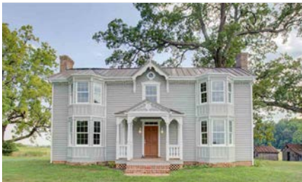
5056 Venable Rd, Kents Store $379,000