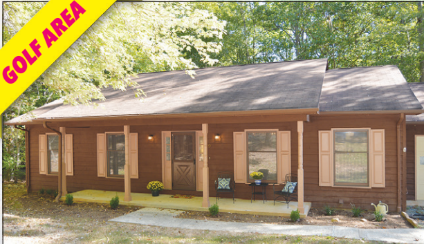
9 Dogleg Road $199,900

Spacious one level home with attached oversized 2 car garage. Living room, dining room, brick wood burning fireplace, large eat in kitchen. Built in bookcases, new flooring, fresh paint & back deck. Near shopping & golf course.