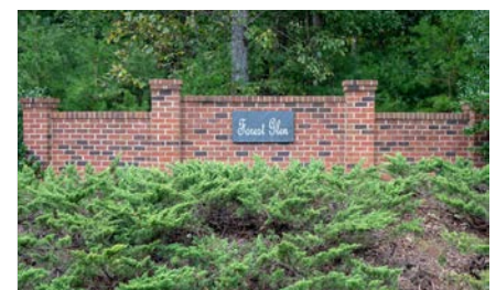
Forest Glen, Palmyra From $50,000