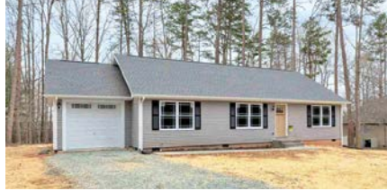
45 Hardwood Rd, Lake Monticello $239,000