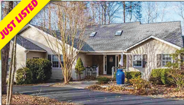
61 Wildwood Road $309,000

Awesome location! Walk to the Beach! One level, ranch home with tile entry, laminate floors. Vaulted ceilings, skylights, stone fireplace, formal dining room, large eat in kitchen with breakfast bar. Sun Room, huge master bedroom suite, home office. Attached 2 car garage, paved driveway.