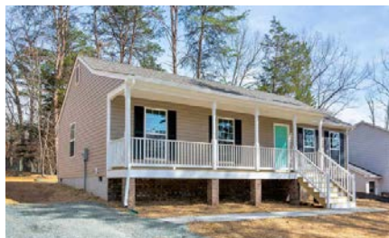
28 Bolling Circle, Lake Monticello $199,999