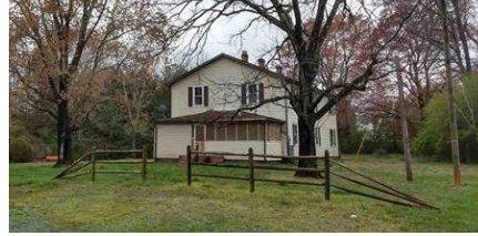
2790 W River Rd, Scottsville $139,900