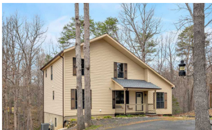
5 Kanawha Court, Lake Monticello $249,900