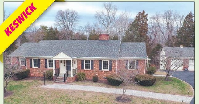
3432 Keswick Road $674,000

Immaculate home on 7 acres in Keswick. 5 min. to Charlottesville with dividable lot. 3 bedroom, 2.5 bath, first floor master suite, formal living room & dining room. Large eat in kitchen, two fireplaces, detached garage. Screened porch, full basement & workshop/2 sheds.