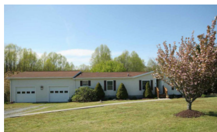
209 Social Hall Rd, New Canton $154,900