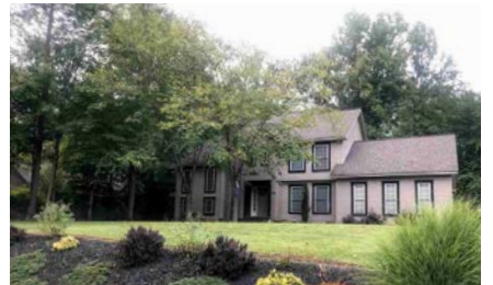
40 Brougham Rd, Palmyra $329,000