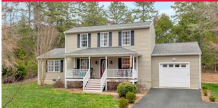
13 Windy Way, Lake Monticello $269,900