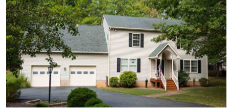
4 Ponderosa Ln, Lake Monticello $272,000