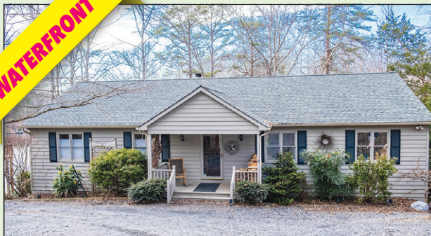
13 Old Homestead Circle $524,900

Waterfront home with amazing views, 100' water & boat dock. 3000+ fin sq. ft. with 3 master bedroom suites. Open flare with hardwood floors, vaulted ceilings, skylights, kitchen with center island, custom cabinets, ss appliances. 2 large viewing decks, full finished walk out basement.