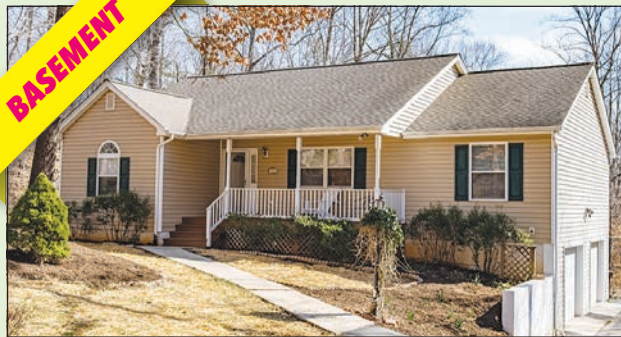
29 East Point Road $269,000

Spacious ranch with split bedroom design. Living room with gas log fireplace, formal dining room & large eat in kitchen with nook, breakfast bar. Finished terrace level has family room with gas log fireplace, huge attached 2 car garage, screened porch & garden area. Private lot near shopping, restaurants.