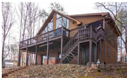
43 S Bearwood Dr, Lake Monticello $489,000