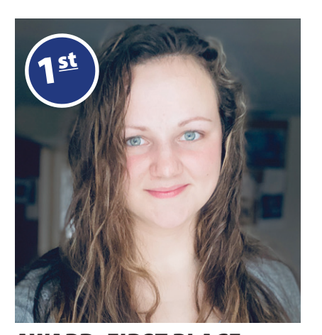
AWARD: FIRST PLACE Category: Page Design Winner: Amelia McConnell Entry: Design and Presentation