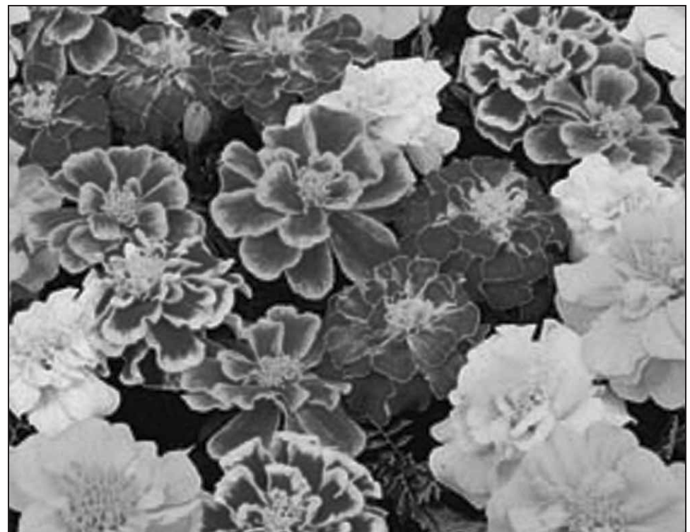
Annuals, like marigolds, grow best in full sun.