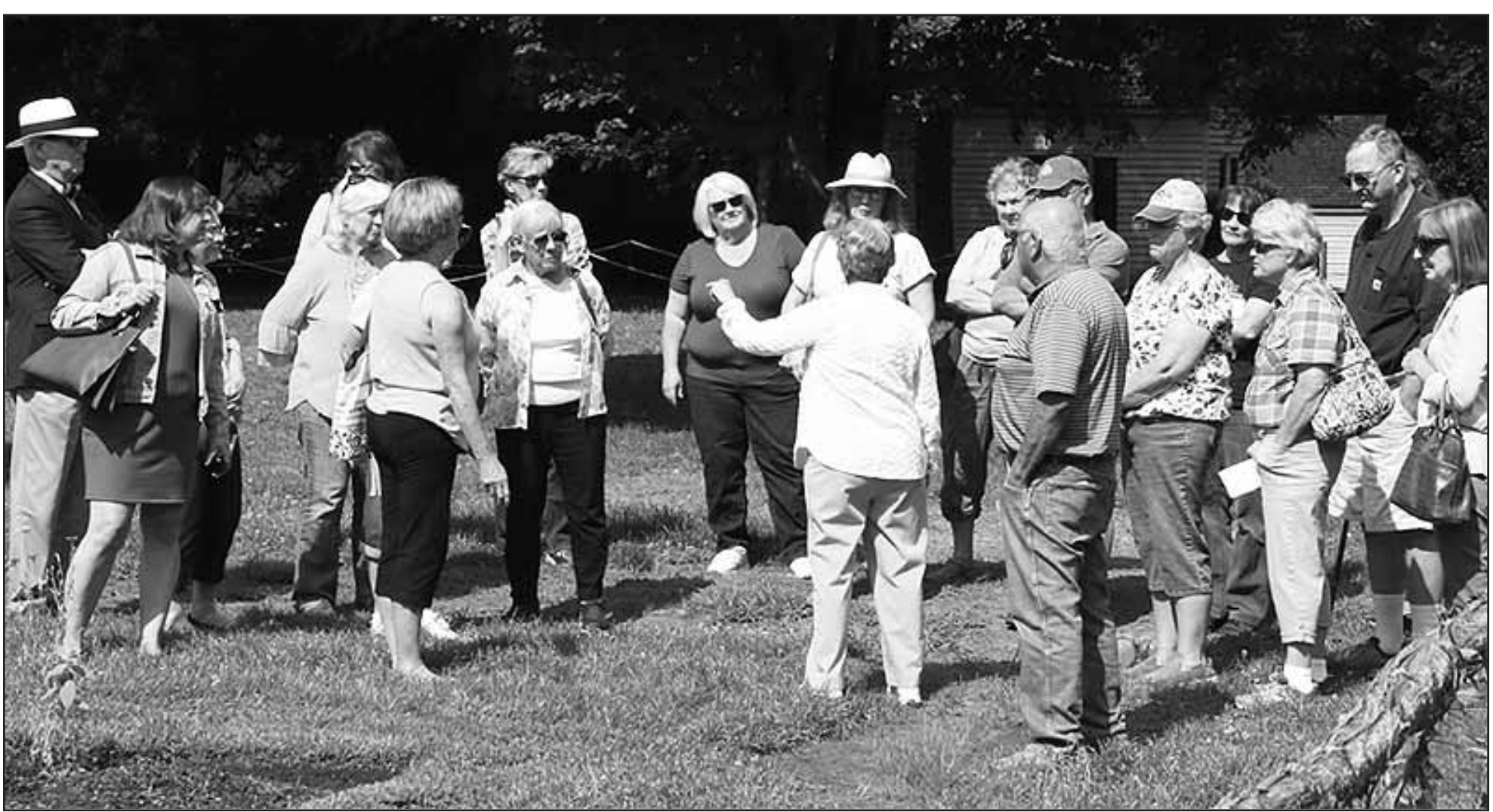
On one of their recent outings, master gardeners toured Tuckahoe Plantation near Manakin, VA.