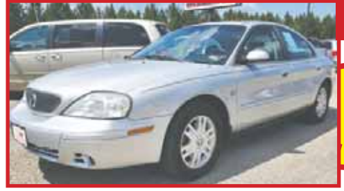
#2776A - 2005 Mercury Sable