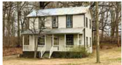
Reduced Price! Only $49,995 4bdrm / 1792 sqft, in-town!