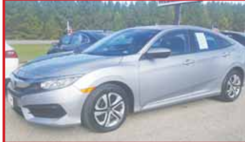
#2777 - 2016 Honda Civic