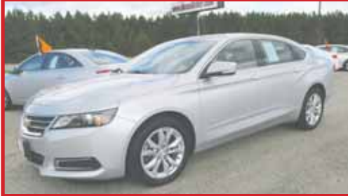
#2715 - 2017 Chevrolet Impala LT

Come by today to Rt. 15. South of Dillwyn and Look Us Over You're always WELCOME at Moss Motor