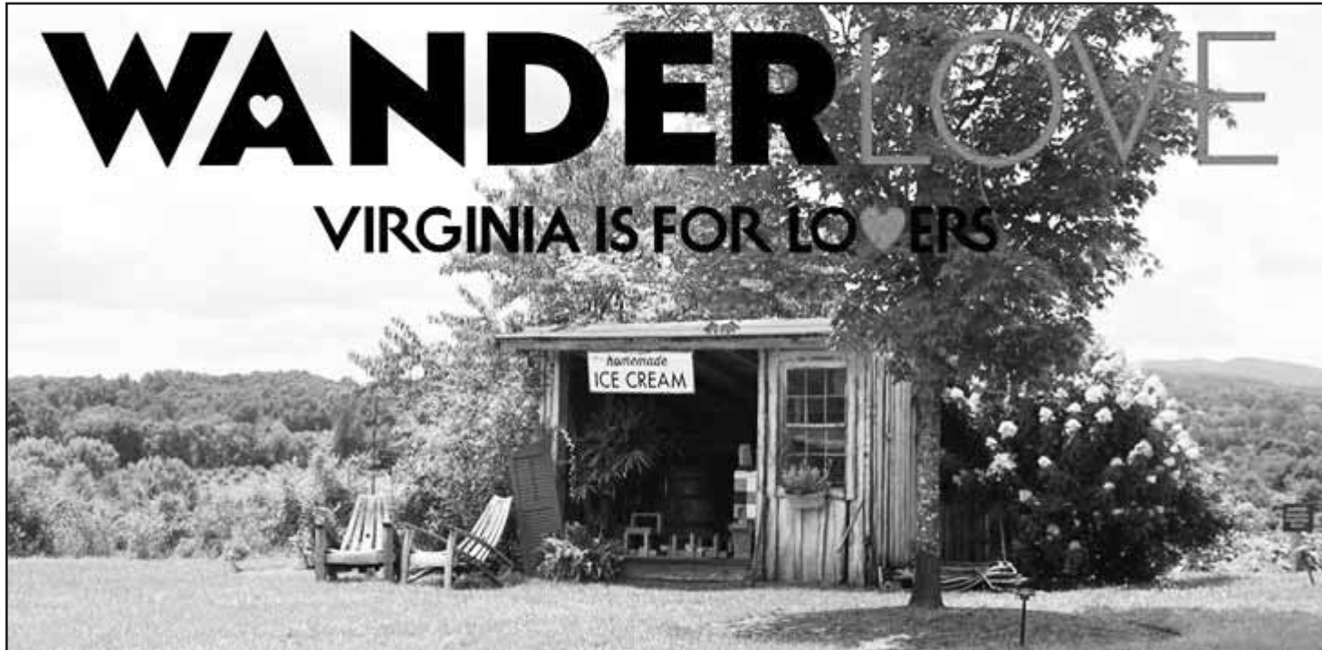
Orange County Tourism campaign WanderLove.