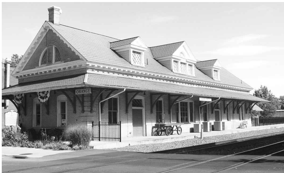
The historic train depot.