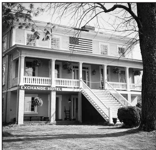
The Exchange Hotel and Civil War Medical Museum.

The Exchange Hotel is on track to RE-OPEN August 4th with new hours and website!! It's been a LONG hard few months, but we have made it so far. We would like to THANK all the donors, without your help we could not have made it this far. We still have a long road ahead. We are continuously monitoring COVID-19 updates with the Virginia Department of Health, and this date COULD be changed if the number of cases in Virginia keep climbing and we go back to Phase 2. But as of right now fingers are crossed.