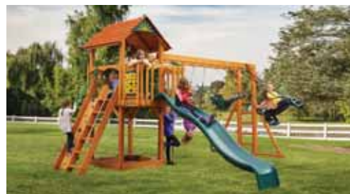
Wood Swingsets Available for Purchase with Free Setup Included.