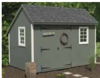
Storage Sheds Customized to your needs, Delivered and Setup to Your Location!