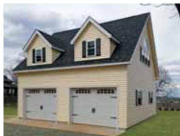
Two Story Multiple Car Garages Customized for You Delivered to or Built on Your Site