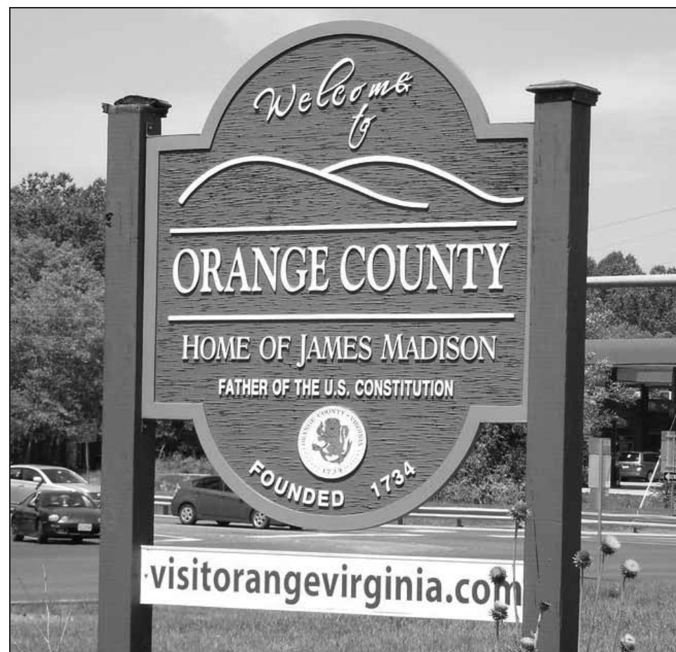
Orange County is a leading travel destination in Central Virginia..