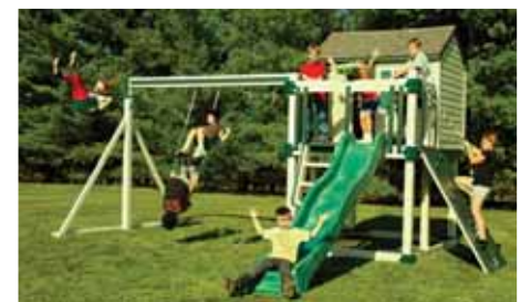
Create Memories for a Lifetime in your own backyard! With over 75 Models to Choose From!