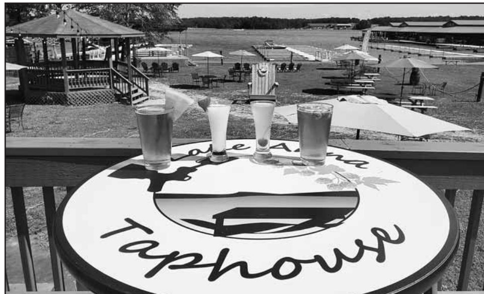
Walk out the back of Lake Anna Taphouse and enjoy drinks, food and a view that can't be beat!