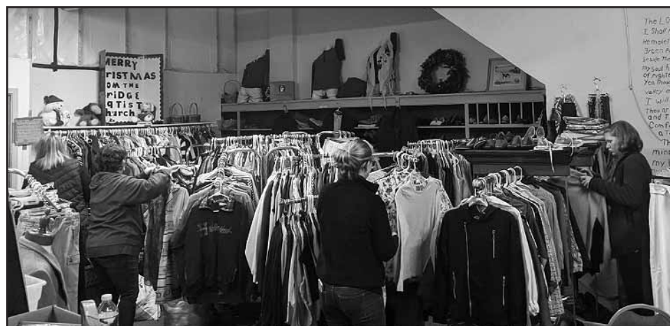
Volunteers sort clothes in The Closet, located on the first floor of the building.

have extra funds, we can send the church a check and we know it will be used wisely," she said. "He travels from his home in Princeton three or four times a week in addition to the weekend service. Church attendance has increased from less than 10 to over 50."