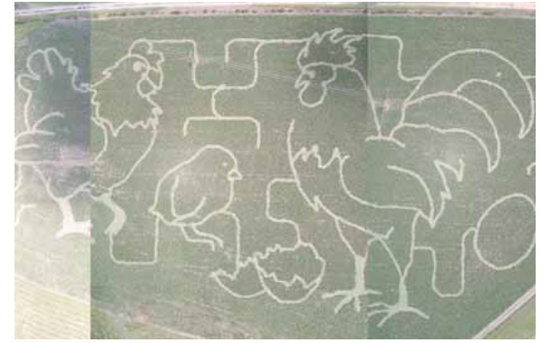
Our chicken corn maze.

Come see our beautiful acorn squash and heirloom pumpkins in all their colors. These pumpkins are featured in the decorating articles often found in Martha Stewart, Country Home, and Southern Living. Remember we also have mums, pansies, straw, cornstalk bundles and beautiful Indian Corn for your decorating needs.