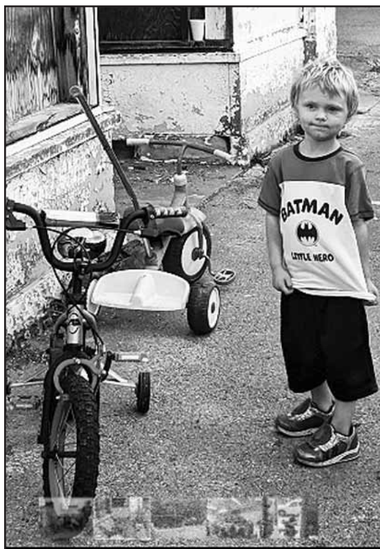
A Matoaka boy is pleased to now have "wheels" which had been donated to the ministry.