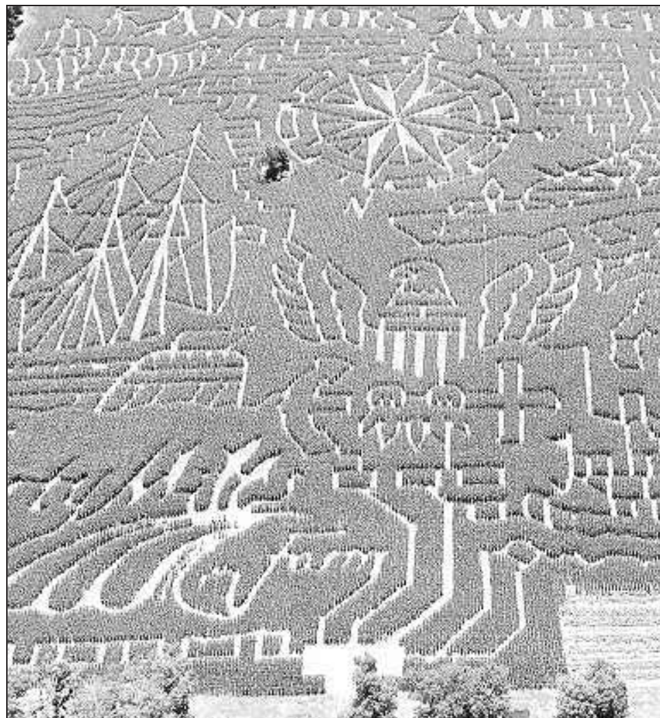
Anchors Aweigh – 2020 Corn Maze – 34 Acres.