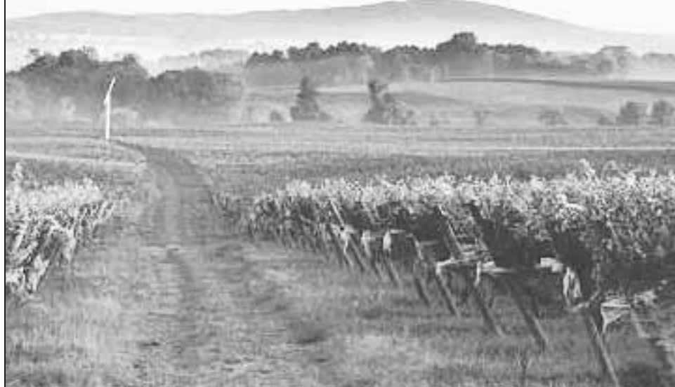
The Barboursville Vineyards.

2020 is a year of broadened horizons—albeit the skyline is closer to home. Whether you've been hitting the trails on a new bike or honing your ukulele skills, you've embraced the unexpected. In keeping with your journey, this installment of WanderLove highlights unexpected autumn adventures around Orange County.