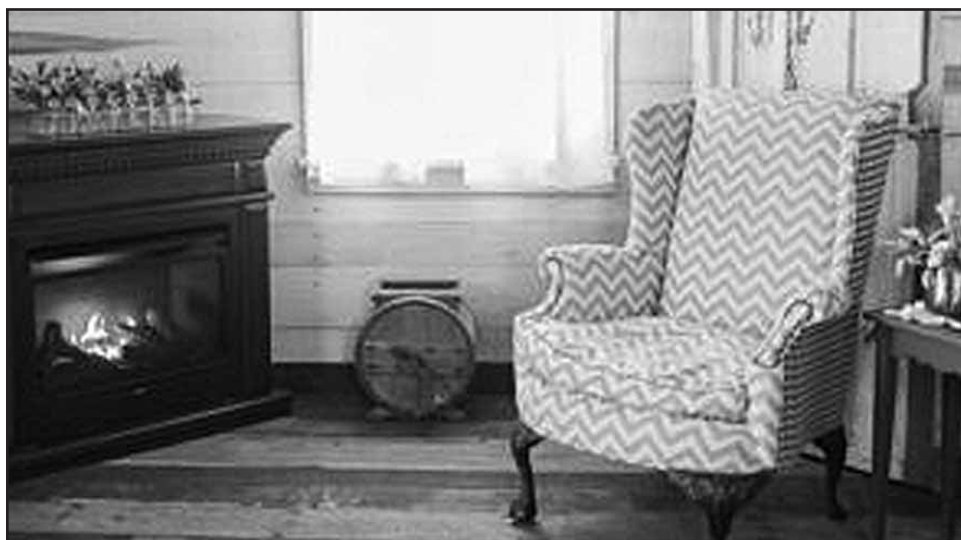
Inside the guest cottage at Rounton Farm.

Turn over yet another new leaf in Orange County this season. Adventures off that well-traveled path are the best reasons to roam.