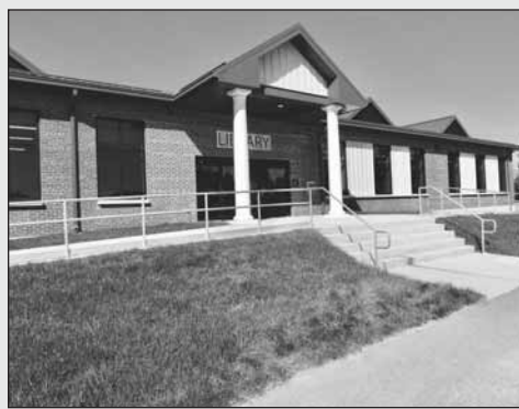
The front of the new library's building is connected to the Buckingham County Community Center. It is a welcoming beacon for all citizens of the county.