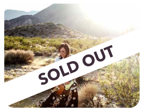
Suzy Bogguss January 8 at 7:30pm $42 per ticket!