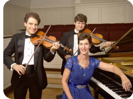
The Rainier Trio March 6 at 4:00pm $11 per ticket!

The Ivy League of Comedy February 26 at 7:30pm $26 per ticket!