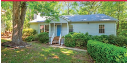
11 Tallwood Trail, Palmyra $300,000