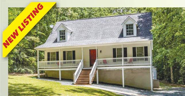
11022 S. Constitution Route $339,000

Private ranch split bedroom home on 3.12 acres with 3 bedrooms, 2 full baths. New carpeting throughout and just freshly painted. Enjoy the large family room with fireplace. Large owners suite with attached bath & soak tub. Side entrance offers mudroom with washer/dryer. Back deck, level yard and storage shed.