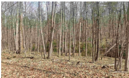
Lot 45A Buck Island Rd, Palmyra $149,900