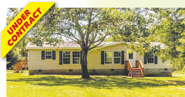
667 Equestrian Trail Road $179,000

Attached End Unit in the popular Sycamore Square neighborhood. Built in 2009, with 3 bedroom, 2.5 bath, open kitchen with breakfast bar, plenty of cabinets and counter space. Convenient 2 nd level laundry. Lawn care is included in the exterior maintenance. Walk to restaurants, shops, Pharmacy and doctor appointments.