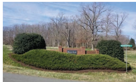
13 Pine Shadow Ct, Palmyra $85,000