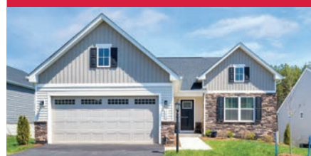
160 Virginia Ave, Palmyra $409,900