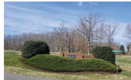
Lot 4 Meadow Brook Ln, Palmyra $60,000