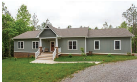
275 Folly Road, Bumpass $379,900