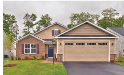
121 Park Drive, Palmyra $410,000