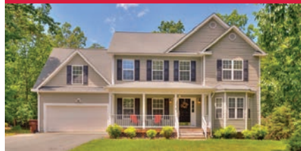
34 Marwood Drive, Palmyra $395,000