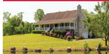
103 Orchard Park Rd, Palmyra $649,900