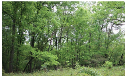
28 Andersonville Lane, Palmyra $65,000