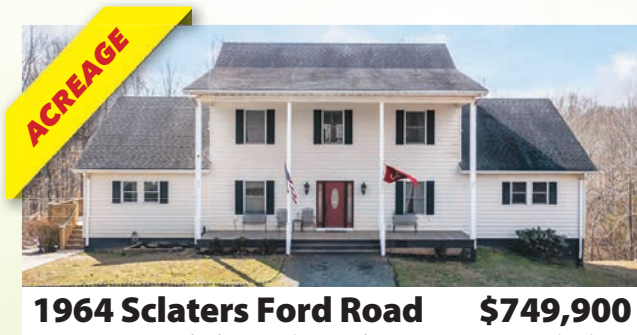
1964 Sclaters Ford Road $749,900

Situated on the 7 th Fairway overlooking the pond. One level living with expansive ceiling & exposed beams in the living room. 3 bedrooms, 3.5 baths with over 2300+ fin. sq. ft. Hardwood flooring, wood stove, master bedroom with golf views & walk in closet, large dining room. Loft for a home office + a full walk out basement. Level Golf Front lot near shopping & restaurants.