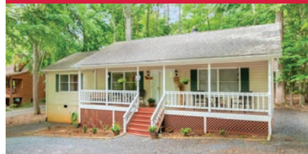
886 Jefferson Drive East, Palmyra $250,000