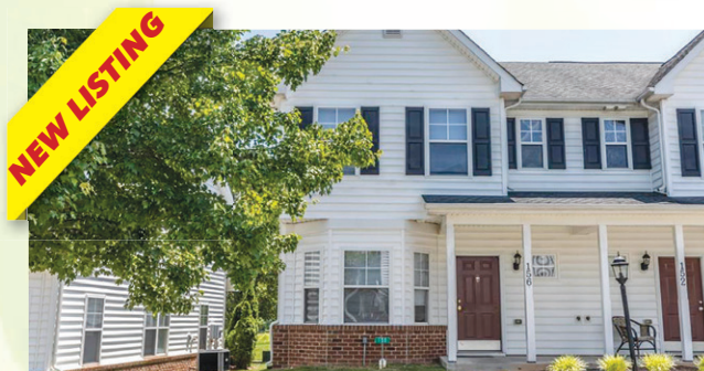
156 Villa Circle $260,000

Gorgeous home on 11+ acres conveniently located just 4 miles to I 64. 4 bedrooms, 2.5 baths, first floor owner's suite with luxury bath, huge walk-in closet, bonus room. Formal dining room, Sun Room with wood burning fireplace, crown molding, tray & 9' ceilings, hardwood floors. Large eat in kitchen with center island, pantry, nook, custom cabinets & Solid Surface counters. Situated on a quiet, cul de sac with level yard, creek, attached 2 car garage & back deck.