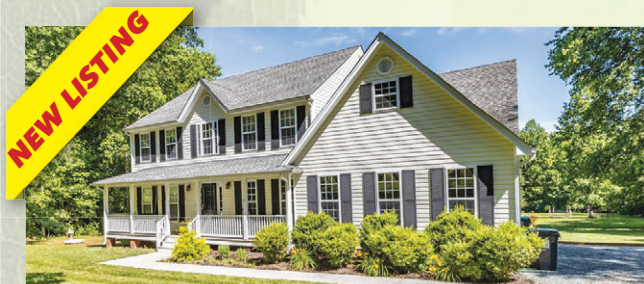
169 Hillsborough Lane $579,500

Let us show you how to get the highest & best price for your home in this market.