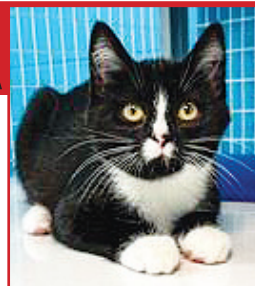
Janey is a super active and lovable kitten.

Meet Janey & Bria , a bond pair of kittens who need to be adopted together. If you are ready for a lively and affectionate pair, Janey & Bria are the perfect match to fill your days with excitement, love and joy!