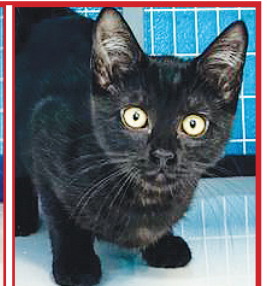
Bria is a sweet kitten with lots of energy & a heart full of love.

Janey & Bria are both spayed, microchipped & current on all their vaccines.