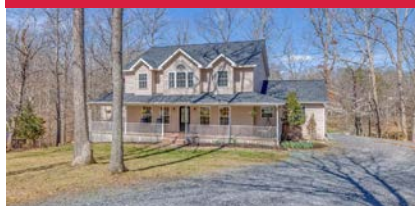
21 Brassie Terrace Lake Monticello $699,900