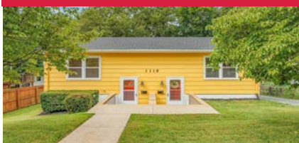
1318 Hampton St Charlottesville $435,000