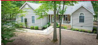
9 Ponderosa Lane Lake Monticello $489,900