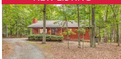
15 Long Leaf Lane Lake Monticello $310,000