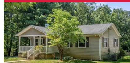
773 Beals Lane Scottsville $275,000