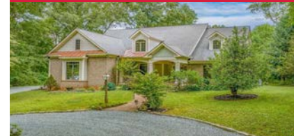
9315 Chestnut Grove Esmont $727,000