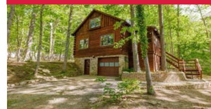
711 Jefferson Dr. Lake Monticello $407,500