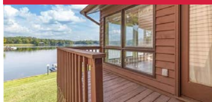
B2 Marina Point Lake Monticello $479,000