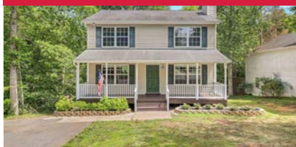
53 Lafayette Lake Monticello $325,000