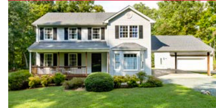
5985 Union Mills Rd. Troy $575,000