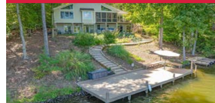
11 Whippoorwill Lane $1,275,000