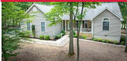
9 Ponderosa Lane Lake Monticello $489,900