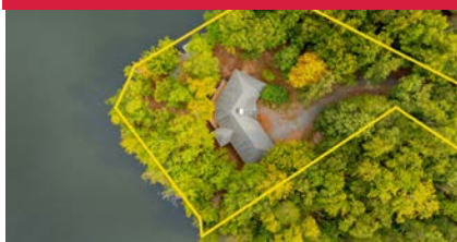
22 Barefoot Lane Lake Monticello $825,000