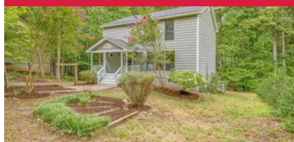
15 Tanglewood Rd. Lake Monticello $400,000