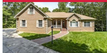
5 Thrush Ct. Lake Monticello $669,900