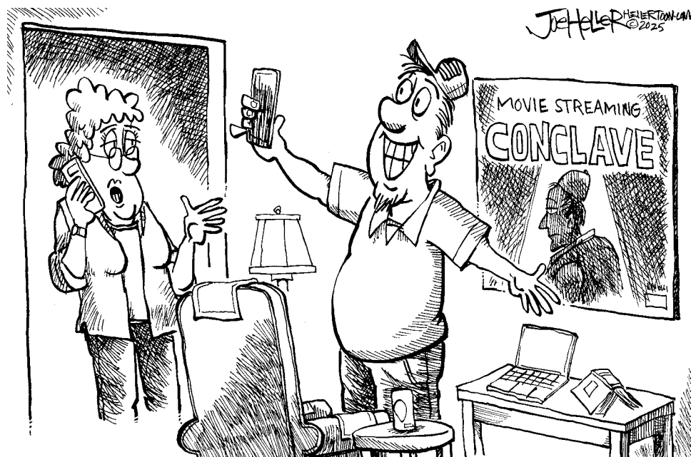
"FIRST IT WAS COVID, THEN IMMIGRATION, THEN TARIFFS... NOW HE'S PREPARING TO BE AN ONLINE EXPERT ON SELECTING A NEW POPE."

The question of using ERA funds to help pay the PPP loan will be on the ballot that will go out to residents in the next few weeks. Results will be announced at the annual meeting in late June.