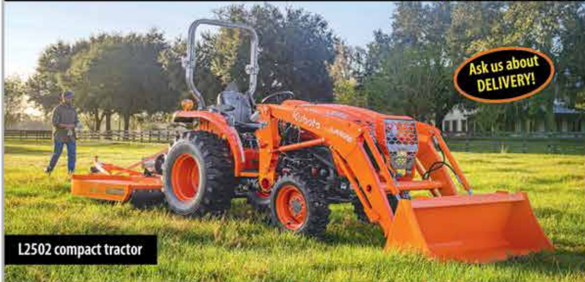
L2502 compact tractor