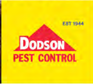
"Subterranean Termites at work—protect your home Today!"

Free Inspections. Professional Service Since 1944.