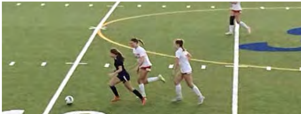
Flucos take on Goochland.

In a closely contested game, the Fluco girls soccer team was outscored but not really outplayed on April 24. The first half was an even match-up as both Fluvanna and the Goochland Bulldogs had some scoring opportunities that they could not convert. With time running out in the half, and possibly with time actually run out, the Bulldogs put the ball into the net. The referee immediately blew his whistle signaling the end of the half. The referee keeps the time on the field and the stadium clock is stopped at two minutes, since it is not official. Spectators wondered whether the referee in rushing to follow the run down the field by the Goochland attacker might have not noticed that time in the half had run out before the score. In