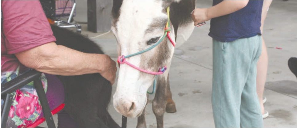
Donkeys at the festival.

Two of Fluvanna County's leading animal rescue groups will be joining nine others from throughout Central Virginia at the third annual Creatures Great & Small Festival being held on Sept. 21 at the Scottsville Pavilion. Caring for Creatures Animal Sanctuary