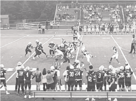
Fluco football.