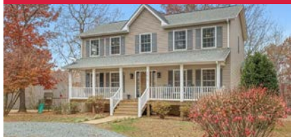
2515 Ducks Lake Ridge Fluvanna $539,900