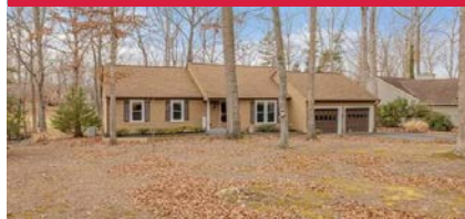
28 Out Of Bounds Lake Monticello $469,000