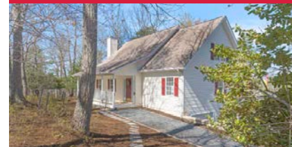
42 Cliftwood Rd. Fluvanna $695,000