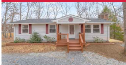
15 Smokewood Dr. Lake Monticello $359,000