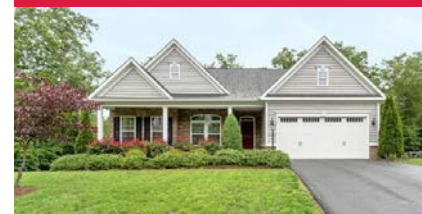
281 Manor Blvd Fluvanna $569,900