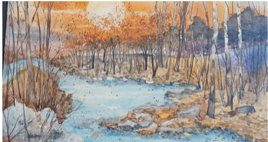
Debbie Morrow - Where The Moon Rests