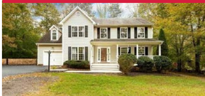
503 Jefferson Dr. Lake Monticello $374,900