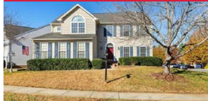
22 Villa Ave Spring Creek $524,950