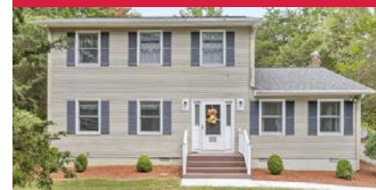
340 Jefferson Dr. Lake Monticello $342,000